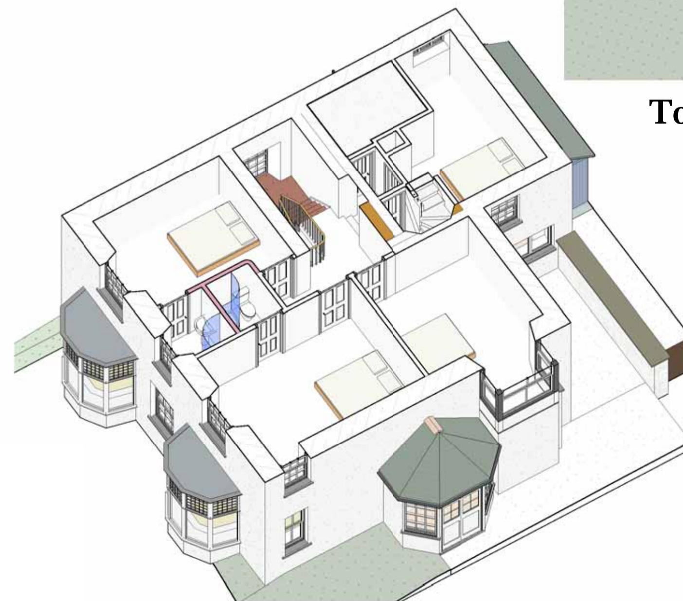
1st Floor Isometric