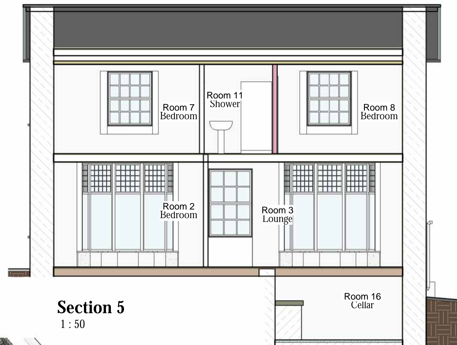
Section 5 1 : 50