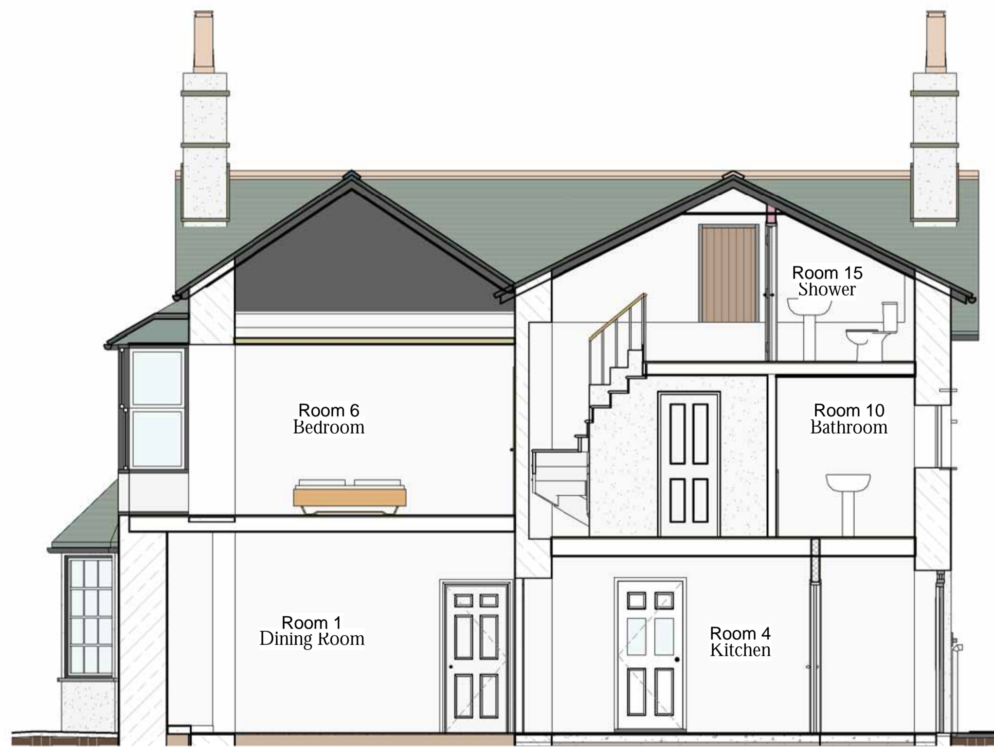
Section 7 1 : 50