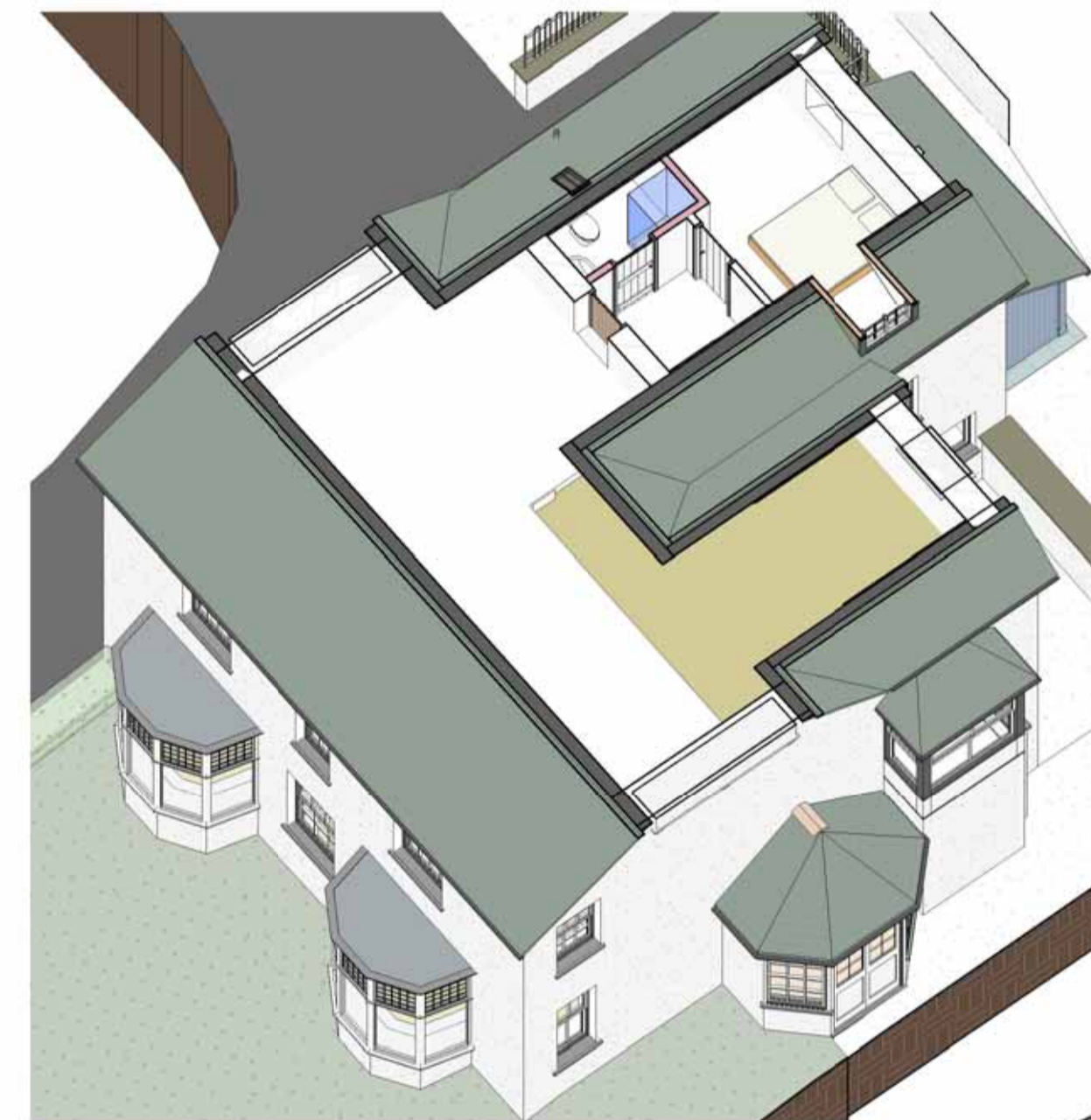
Top Floor Isometric